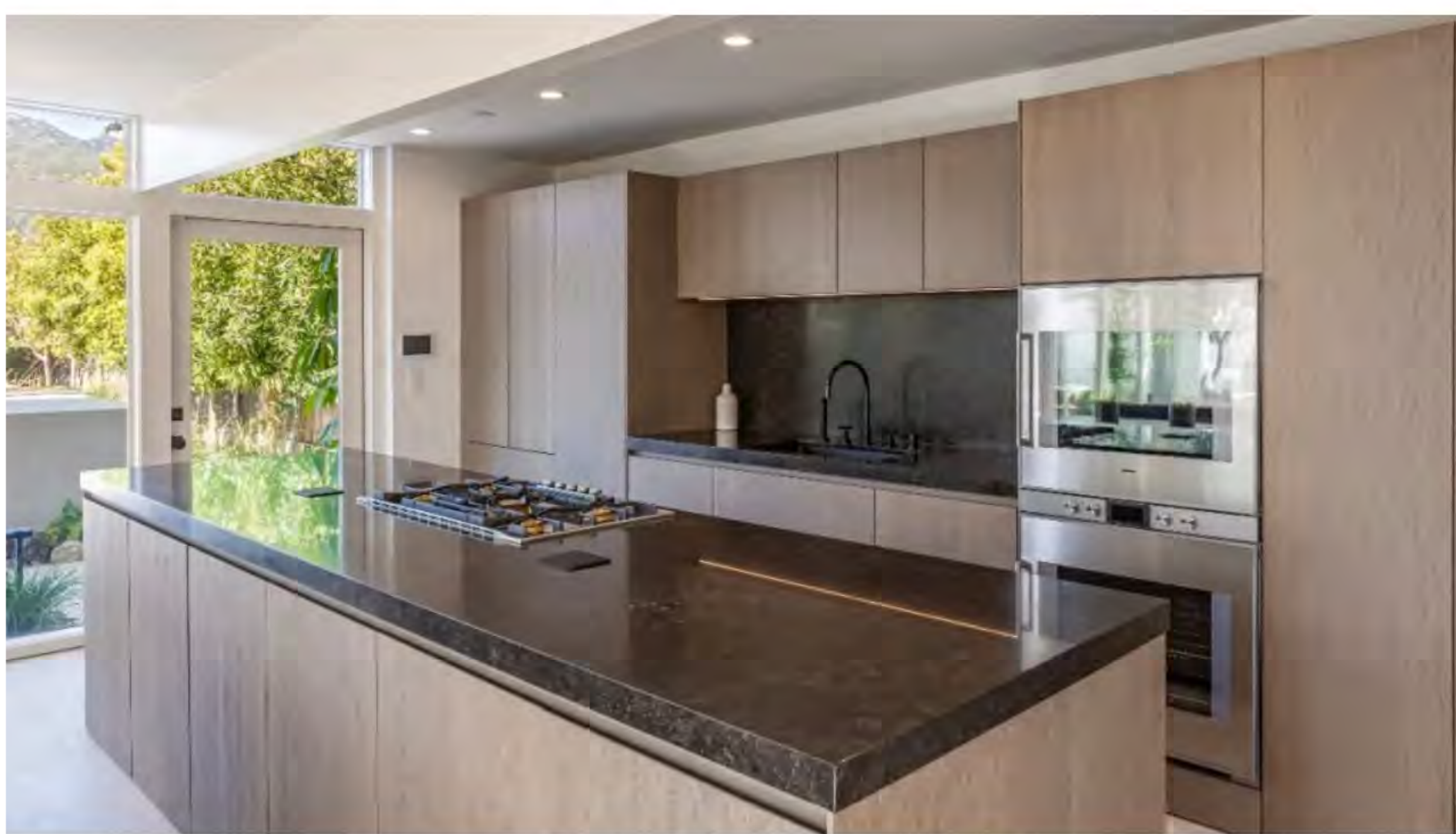
The kitchen's hard edges are softened by the grain-matched wooden cabinetry.

Quiet luxury has become an overused phrase in both fashion and design, but the residence is nonetheless imbued with that timeless element, which is embodied through a neutral color palette, scrumptious fabrics, and organic, quality materials including wide-plank, white oak floorboards. Soaring, 20-foot-high ceilings add volume and grandeur, while sandblasted and brushed limestone mimic the nearby beachfront.